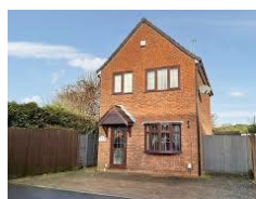
A Detached House