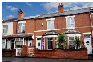
A Terraced House