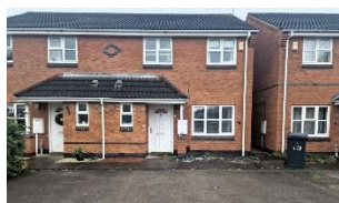
A Semi-detached House